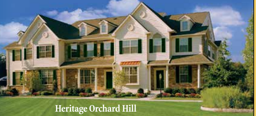
Heritage Orchard Hill