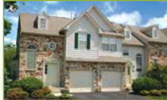
Heritage Summer Hill • Doylestown