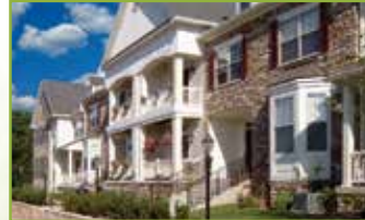
Heritage Greene • Sellersville