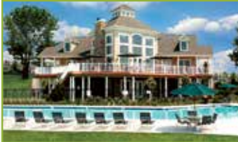
Heritage Orchard Hill - Clubhouse • Perkasie