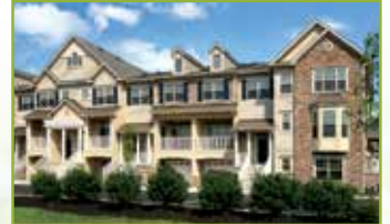
Heritage Pointe • Chalfont